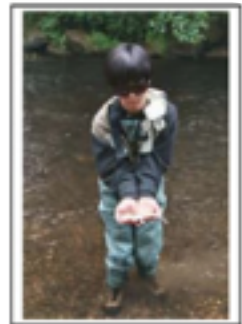
Fishing our local Deschutes