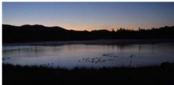
Sunrise over Big Twin Lake.