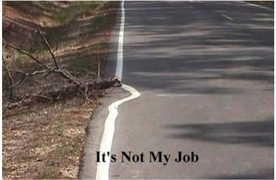
When it comes to volunteering — are you painting lines???????

I received a notice that the original GPO program is now independent from the Washington Wildlife Federation. It is now known as "Go Play Outside Alliance of Washington" (GOPAW). WSCFFF has been active with the original GPO organization for youth activities in the past. Plans are under way for the 2007 Washington Youth Outdoor Expo to be held May 18 and 19 at the Cowlitz County Conference Center in Longview, WA. They expect 10,000 to 15,000 youth and families to attend the event. They are looking for fly fishing participants, mainly for tying. I will contact them and learn more.