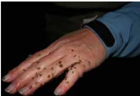
Lake Lenore is filled with olive scuds

One of the functions of your WSC Board is serving as a clearinghouse of public fly fishing related and affiliated club events. If your club has an event open to the public, please provide details to the editor at dpwlaw@gmail.com .