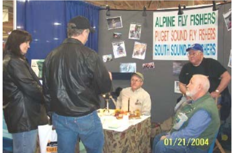
Fly club members at the Puyallup Show.